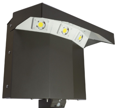
WP2UE With Battery Back-up

The ActiveLED® WP2 Series Wall Pack offers highly engineered optics and a sleek contemporary design ideal for security, pathway and perimeter lighting. With 150 Lumens per Watt and 5,861 Lumens, the 39 Watt,* WP2 Series Wall Pack provides nearly 1,000 sq. ft. of light coverage. The fixtures come with a full 10 year, No-Light-Loss Warranty - providing the building owner with over a decade of energy and maintenance savings. Applications include: Warehouse, Retail, Industrial, and Commercial Locations.